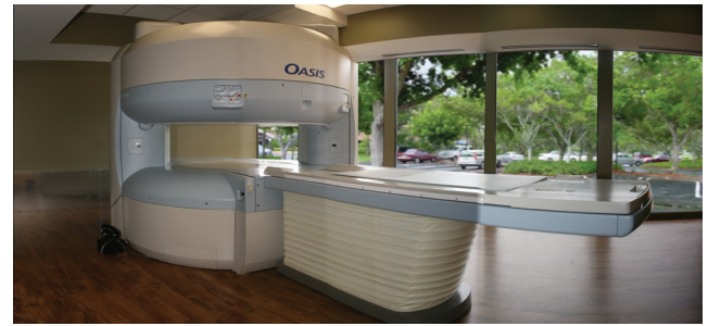
An MRI that is both truly Open & truly High Field

Patient: _____ Phone: _____ LAST FIRST M.I.